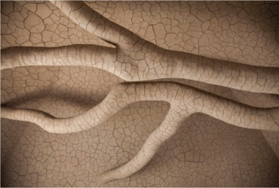
Andy Goldsworthy, Tree Fall , 2013 (installation view)

San Francisco – The FOR-SITE Foundation, in partnership with the Presidio Trust, is pleased to announce the opening of Tree Fall , a new work by artist Andy Goldsworthy in the Presidio of San Francisco on Saturday, October 19, 2013. Installed inside the historic Powder Magazine in the Presidio's Main Post, Tree Fall is constructed out of a eucalyptus tree removed as part the reconstruction of Doyle Drive (the Presidio Parkway project) and clay sourced from surrounding land. The imposing and architectural installation serves as a powerful reminder of the relationship between the Presidio's natural and built environments.